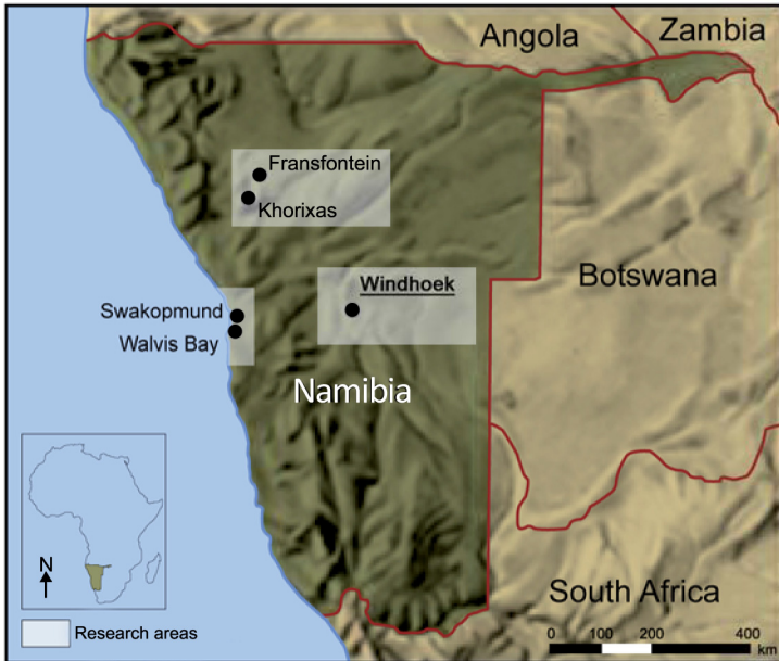
Fig. 1 Rural and urban research areas (Cartography: Ole Neumann) / Ländliche und städtische Untersuchungsgebiete

2001: 2). This situation is certainly the case in the Fransfontein area, southern Kunene region, where most of the research presented in this article was conducted (Fig. 1).